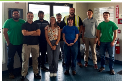
Current Cadet Engineers and previous Cadets who are now full-time HG&E employees.

From its inception in the 1950's, the Cornelius J. Moriarty, Jr. Scholarship for Cadet Engineers has aided Holyoke residents who are interested in pursuing careers in engineering. Successful applicants receive invaluable on-the-job-training with HG&E engineers during the summer as well as an annual scholarship for college-related expenses.